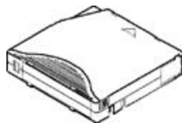
Ultrium Tape Cartridge

LTO specifications have been developed for the Ultrium cartridge format.